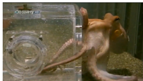
Fig. 7. The learner octopus using the same method as the teacher octopus to open the box.