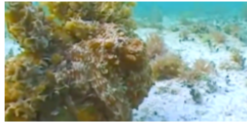
Fig. 3. An octopus camouflaging.

The octopus has multiple evasion techniques that can be used in succession if one happens to backfire. First, the octopus will try its hand at camouflage (See Fig. 3.): transforming its body into seaweed or blending its body perfectly into a rock formation—practically invisible to the untrained