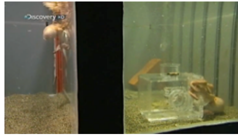
Fig. 6. The learner octopus watching as the teacher octopus open the box.

The teacher was given a glass box that contained a crab, an octopus's favorite meal. The glass box was fashioned with three different methods to open it, a screw top, a top like a jar, and a latch. After watching the teacher octopus open the box, the learner octopus was presented with the same box. The learner octopus then proceeded to use the exact same method the teacher octopus had used to open the box (See Fig. 7.). Multiple trials were conducted in which the box was placed in different ways, and each time the learner octopus opened it using the same method as the teacher. These results prove that the octopus was not just imitating the other, but actually learned. This behavior is interesting considering the traditional way the octopus lives and learns—alone and through trial-and-error (Aliens of the Deep Sea).