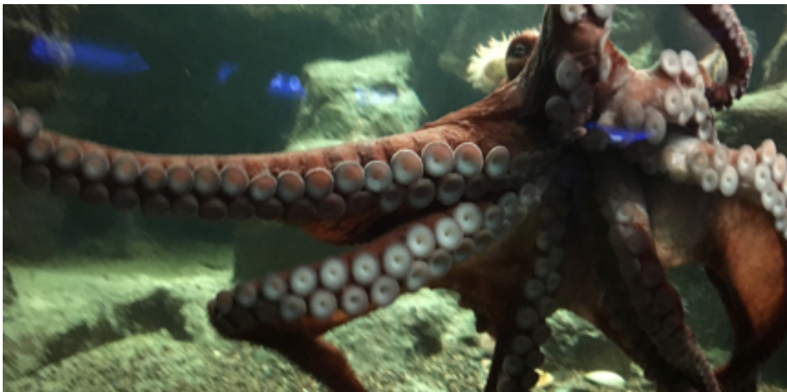
Fig. 1. Oliver the Giant Pacific Octopus of Chicago's Shedd Aquarium.

I sit enthralled as I watch a documentary, about an animal unlike any I have ever seen. The narrator's voice fades to background noise as I edge closer to the screen, inspecting this strange creature that apparently shares the planet with me. The creature is bizarre, its body gelatinous, able to move in ways that I cannot even fathom. It seems to be curious about its surroundings, (see Fig. 1.) purposely exploring them for the sake of learning; but does it truly have the capacity to be curious? It looks like a giant mutated snail that lost its shell and grew eight, long arms. The narrator's voice returns to my ears and I hear him say that this slimy creature has nine brains—one for each arm, meaning that each arm has a mind of its own. I wonder, "How is that even possible?"