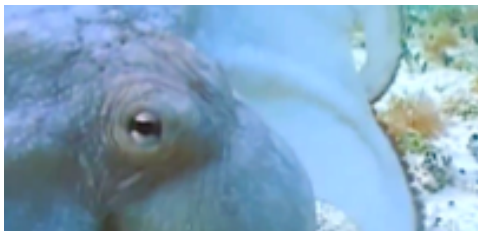
Fig. 4. An octopus turning white.

eye. If the predator spots it, it will turn as white as a sheet (See Fig. 4.) to terrify and then vanish using its siphon, to jet through the water. If the predator gives chase, it will let loose its ink in order to mask the octopus's smell which allows the octopus to escape. The ink also