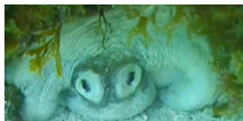
Fig. 5. An octopus using its final scare tactic.

serves as a deterrent to the predator. When the ink is released, the predator may confuse it with the octopus and take a big bite, only to swim away in disgust. If all else fails, the octopus can expand its tentacles to feign a larger size and grow horns to scare the predator off (See Fig. 5.)