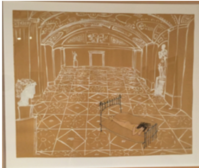
Rocio Garcia's Sin Titulo , de la serie Museos .

She chuckled and watched me roam the rectangular room a few more times before I moved on to check up on the rest of the museum. Without her eyes on me, I felt a new sense of freedom. I examined the paintings much closer than I had before, my nose inches away from the glass that kept the paintings in their world and me in mine.